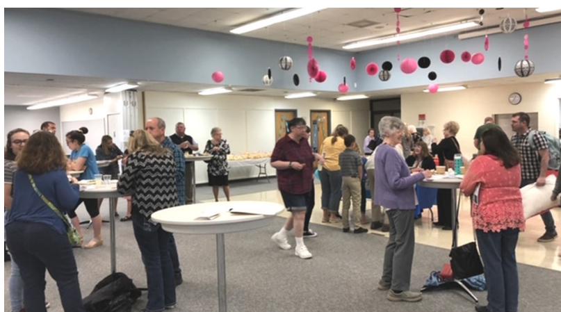
Enjoying Time of Fellowship