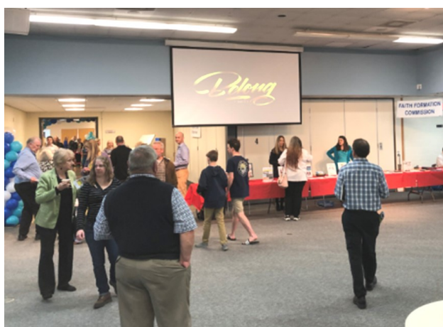
The Faith Formation Display

Needless to say that we all had a great time, and that we all felt blessed as we realized all that is going on in our parish.