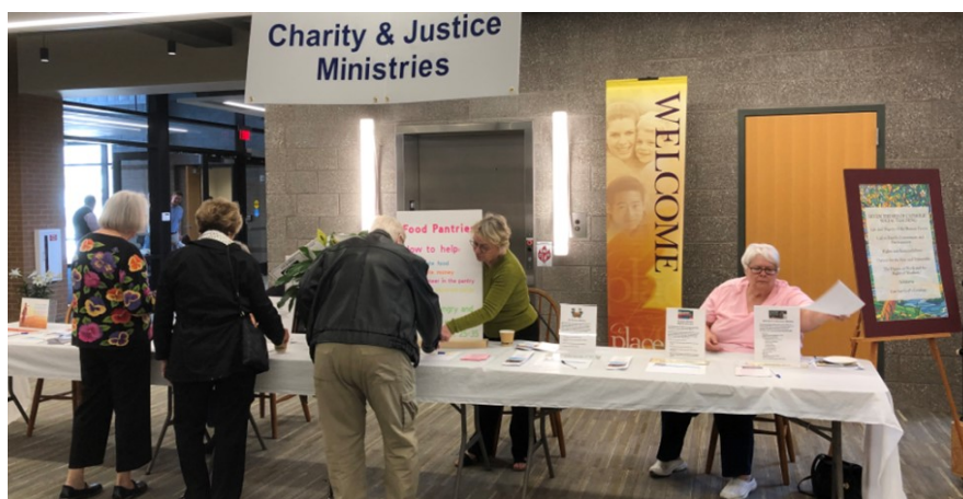
Charity and Justice Always Ready to Serve Those Most in Need