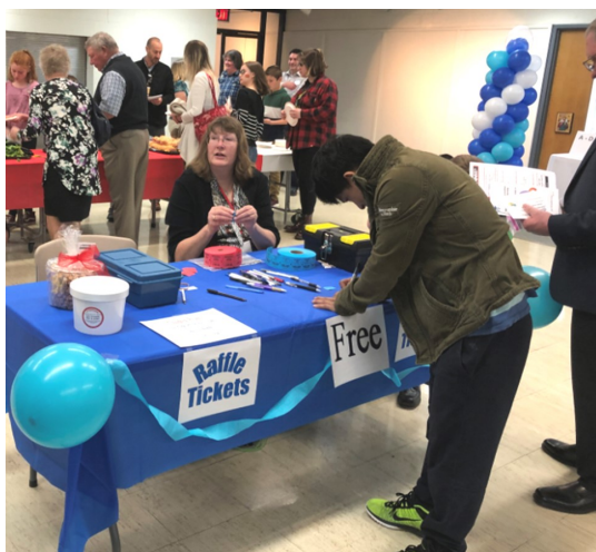
Free Raffle Tickets